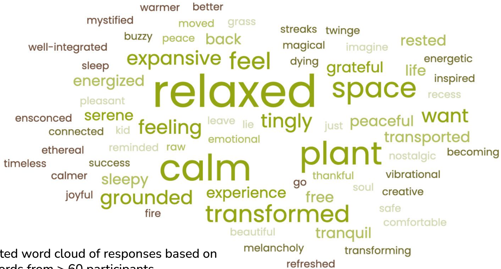
Weighted word cloud of responses based on 200 words from > 60 participants